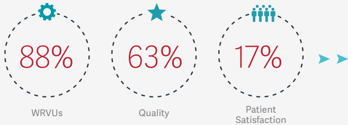
PERCENTAGE OF ORGANIZATIONS